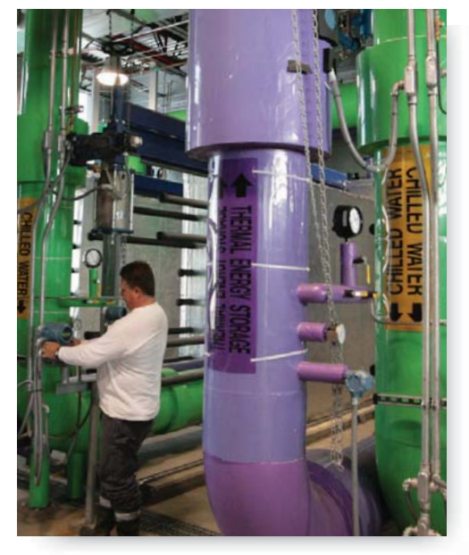
The chilled water plant and its 2.6 million gallon storage tank enables the University to purchase electricity at a lower cost to operate chillers during non-peak evening hours and store the chilled water for use during the day for air conditioning campus buildings and cooling specialized laboratory equipment.